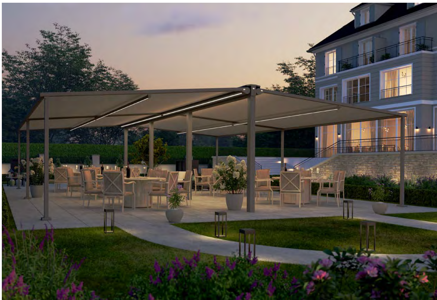
This free-standing structure consisting of a double support frame and four Portofino pergolas creates a shaded, weatherproof space for several guests and large social gatherings.

The universal support frame from Lewens is extremely versatile: pergolas, glass roofs and folding arm awnings can be installed on both sides as a free-standing structure to make optimum use of large spaces and provide maximum weather protection or shade from the sun. Single-sided use of the universal support frame is recommended for walls that are not sufficiently load-bearing, or for peripheral situations without any wall.